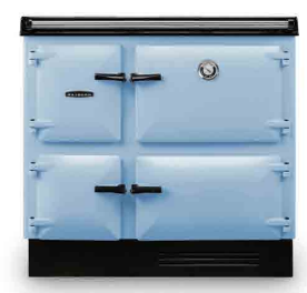
Duck Egg Blue